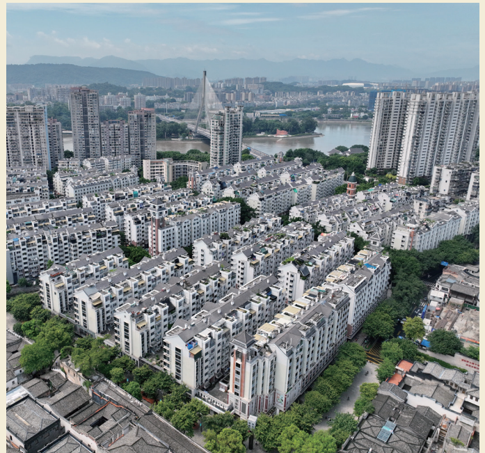
Cangxia New Town in Fuzhou, southeast China’s Fujian Province, on July 13, 2025. Cangxia, a formerly dilapidated area, has been transformed into a modern neighborhood after a major renovation that started in July 2000 and lasted over a year (XINHUA)