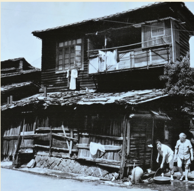
Cangxia area before its major renovation (FILE)