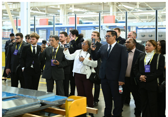
Government leaders from Laos (left) and officials of the Sandinista National Liberation Front, Nicaragua’s ruling party, visit an electric technology company in Xingtang County, Hebei Province, on May 8 as part of their study tour in China. They interacted with local officials and business executives to learn how the development of specialty industries had contributed to extreme poverty alleviation efforts in the region