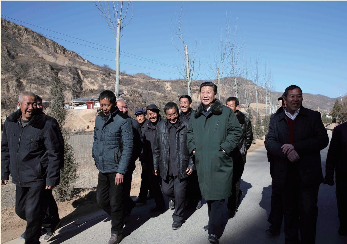
Chinese President and General Secretary of the Communist Party of China Central Committee Xi Jinping (2nd R front), also Chairman of the Central Military Commission, visits people in Liangjiahe Village, Wen'anyi Township of Yanchuan County, Yan'an, northwest China's Shaanxi Province, on February 13, 2015. Xi made a tour in Shaanxi on February 13-16, and extended festival greetings to locals and people across the nation ahead of the Spring Festival, which fell on February 19

Efforts to define and apply a people-centered approach to performance evaluation