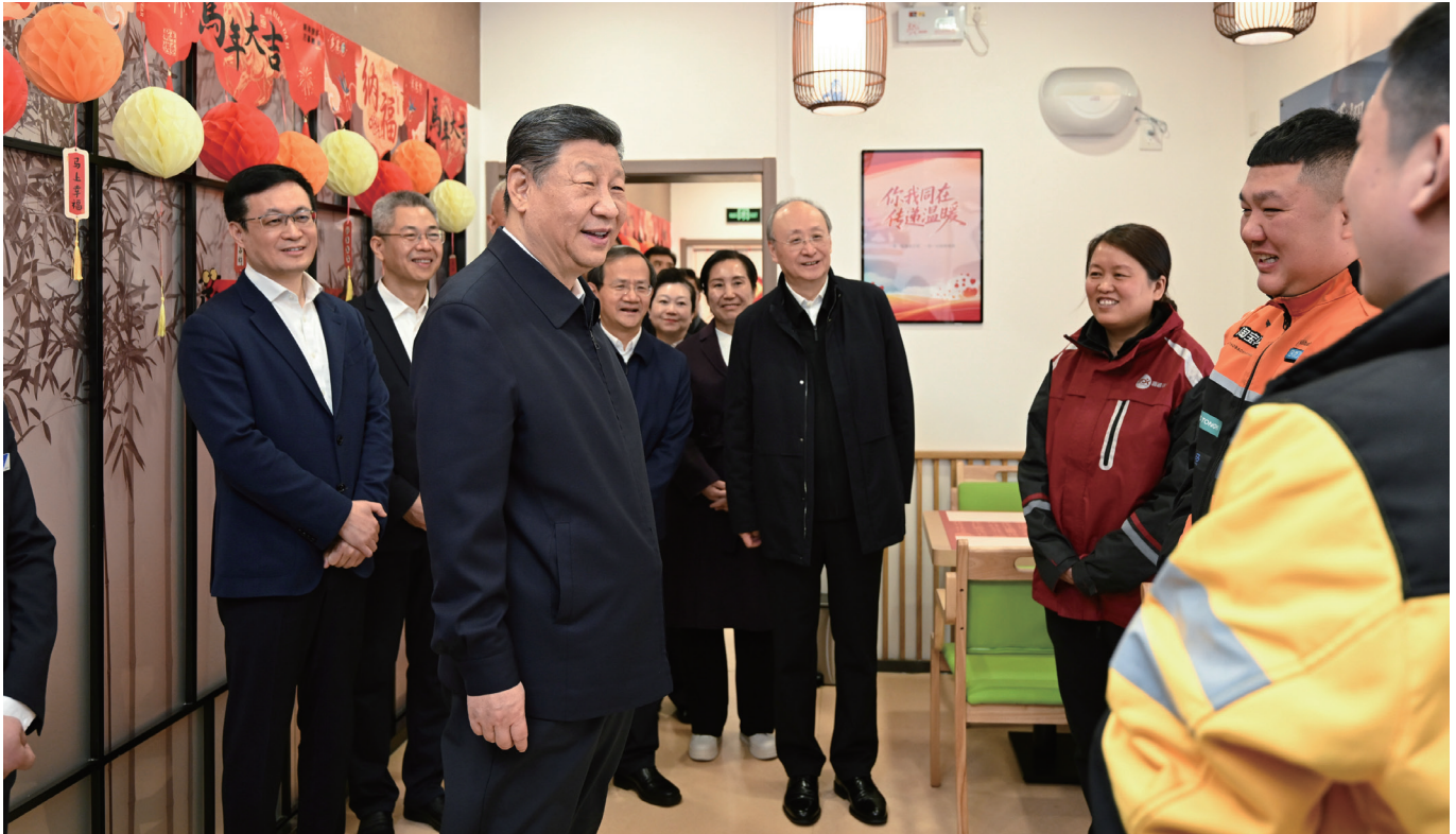
Chinese President Xi Jinping talks with delivery workers while visiting a community canteen for seniors in Xicheng District of Beijing, capital of China, on February 10, 2026

entrusted by the Party and the people, and can only be used for advancing the Party's undertakings for the benefit of the people. Leading officials at all levels must take the right attitude towards power, job performance and career, and take concrete actions to benefit the local people during their term in office, rather than indulging their vanity, pursuing unearned prestige, or achieving worthless outcomes.